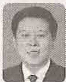
Dr. Wang Jun Vice Minister, Ministry of Finance, People's Republic of China