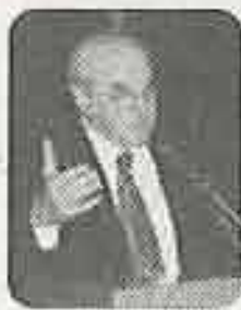
Prof Mervyn Eldred King S.C. Chairman, Global Reporting Initiative (GRI) South Africa