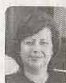
Tan Sri Dato' Sri Dr. Zeti Akhtar Aziz Governor, Bank Negara Malaysia Malaysia