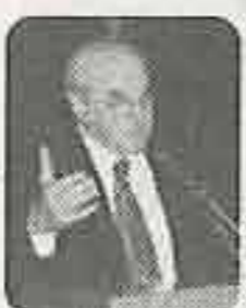
Prof Mervyn Eldred King S.C. Chairman, Global Reporting Initiative (GRI) South Africa